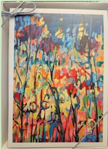
Mandart Greeting Cards