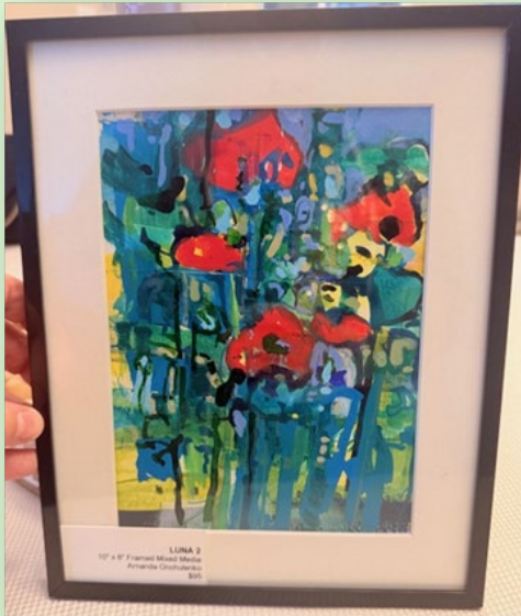
Meditation Series Painting: Luna