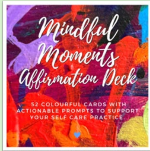
Mindful Moments Affirmation Deck