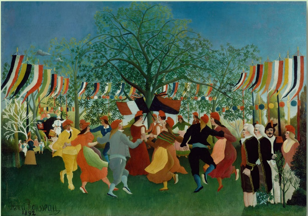
Henry Rousseau, The Centenary of Independence (1892)